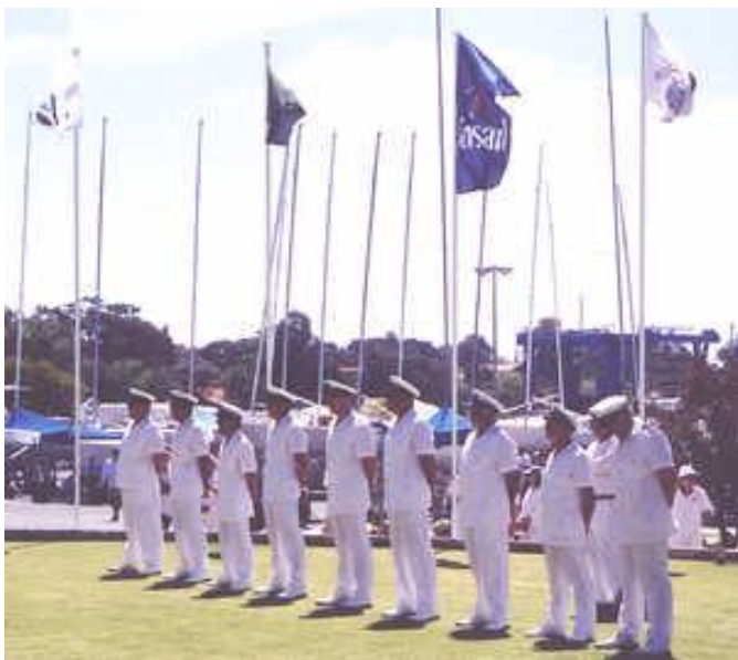
Page 3 of 5

The Race Committee then got organised, loading up their boat with essential supplies, mostly heavy crates that clinked interestingly. The committee all seemed to be "fairly senior citizens", and started and finished us with some sort of firearms. It all went very smoothly and they were certainly kept busy.